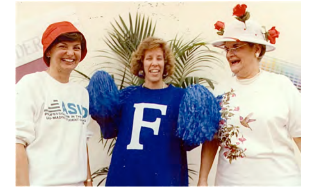
Volunteer training in 1989 at "Camp Lake FIDER" in Chicago.